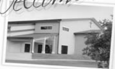
Broken Arrow CHURCH OF CHRIST

"We give our first time local guests one of these 9"x12" folders with color pages of information about the congregation here. If you see someone with one of these folders, please go out of your way to meet and welcome them very cordially."