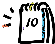
Photo Directory Plans: All families with last names beginning with A-G, that are not represented with a photo in our current directory, will have opportunity this month to have family photos taken for the upcoming directory. Families that have experienced additions or losses since April 2008 will also be given opportunity to have their photos updated. Photos for the remainder of the congregation will be taken at a later date. More details soon.